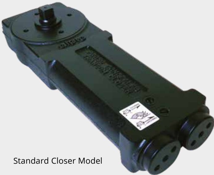
Standard Closer Model