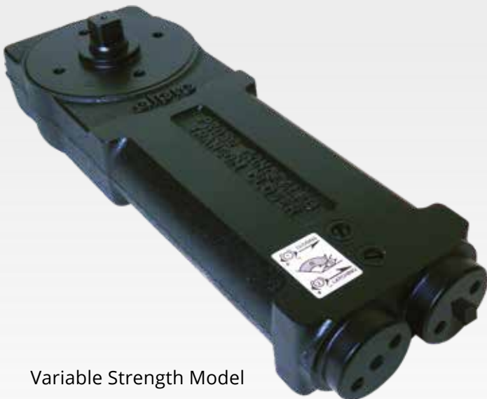
Variable Strength Model

The Alpro PRO50 overhead door closer is designed to be concealed within the transom header bar of the door. It provides controlled closing of a single or double action aluminium doors. Features built into the closer include dual closing speeds to allow flexibility in closing. Our variable version has three levels of spring strength and either 90° hold open or no hold options.