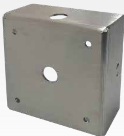
Surface mount housing

The Alpro PB86 infrared proximity switch is designed to be used in conjunction with the full range of Alpro access control products. This proximity switch offers contactless features offering sterile and hygienic operation.