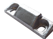
Striker for recessed frames (supplied separately)