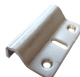
Floor striker (supplied with 83PH3550320)