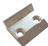
Standard striker supplied with all devices)