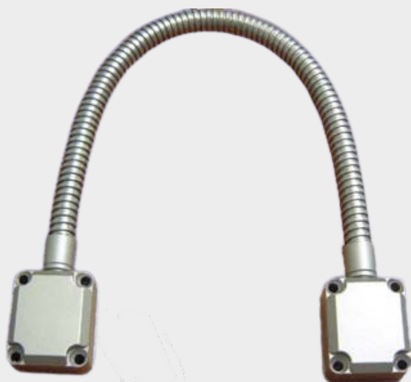
ALP0250-A Surface Door Loop Armoured